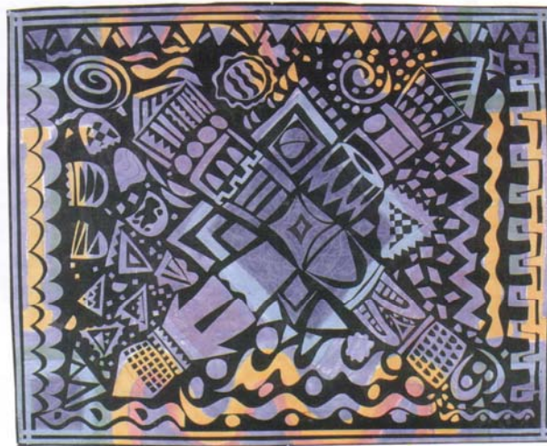
Top: Susan Kee, Purple Vanity , 5' x 6' (1.5 x 1.8 m), stenciled, drybrushed, ragged, and sponged latex and acrylics with textured overlays

A very large canvas may need to be shipped by freight. For freight shipment, roll the floorcloth onto a tube and pack it within a larger plastic pipe. Tape the ends securely. The package is likely to be transported on a forklift, so take the time to pack it well.