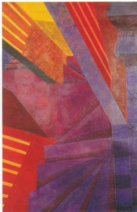
Top: Shari Cornish, Lulu's Day Off , 39" x 42" (99 x 106.5 cm), silk-screened fabric pigment on industrial felt