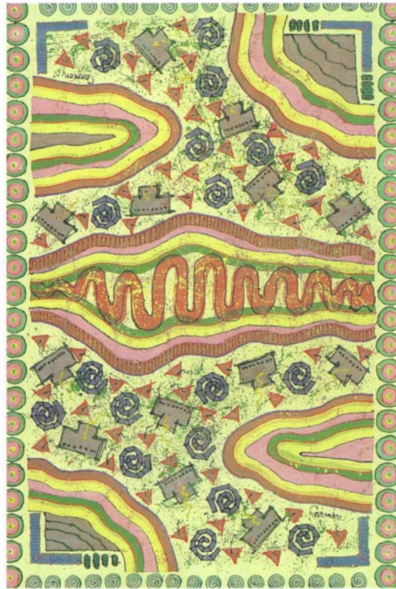
Carmon Slater, Napoli, 39' x 57' (1 x 1.4 m), applied pigments