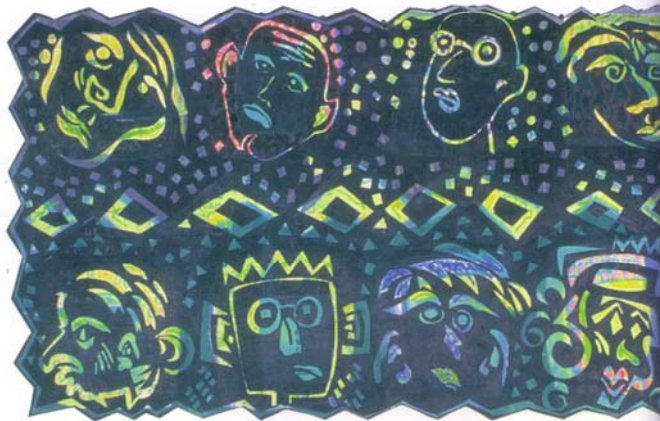
Bottom: Shari Cornish, Recognize Anybody? , 34" x 60" (9 x 1.5 m), silk-screened fabric pigment on industrial felt Photograph: B. Miller