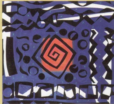
Top: Rhonda Kaplan, Double Border Tulip , 5' x 7' (1.5 x 2.1 m), hand-painted latex